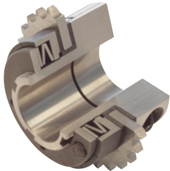
Example: ROBA ® -clamp with fitted chain-sprocket (dimensions on request).